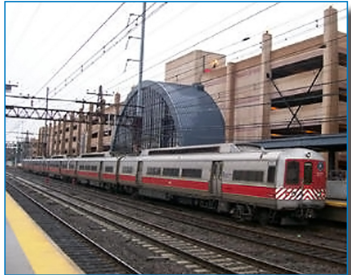
South Norwalk Railroad Station